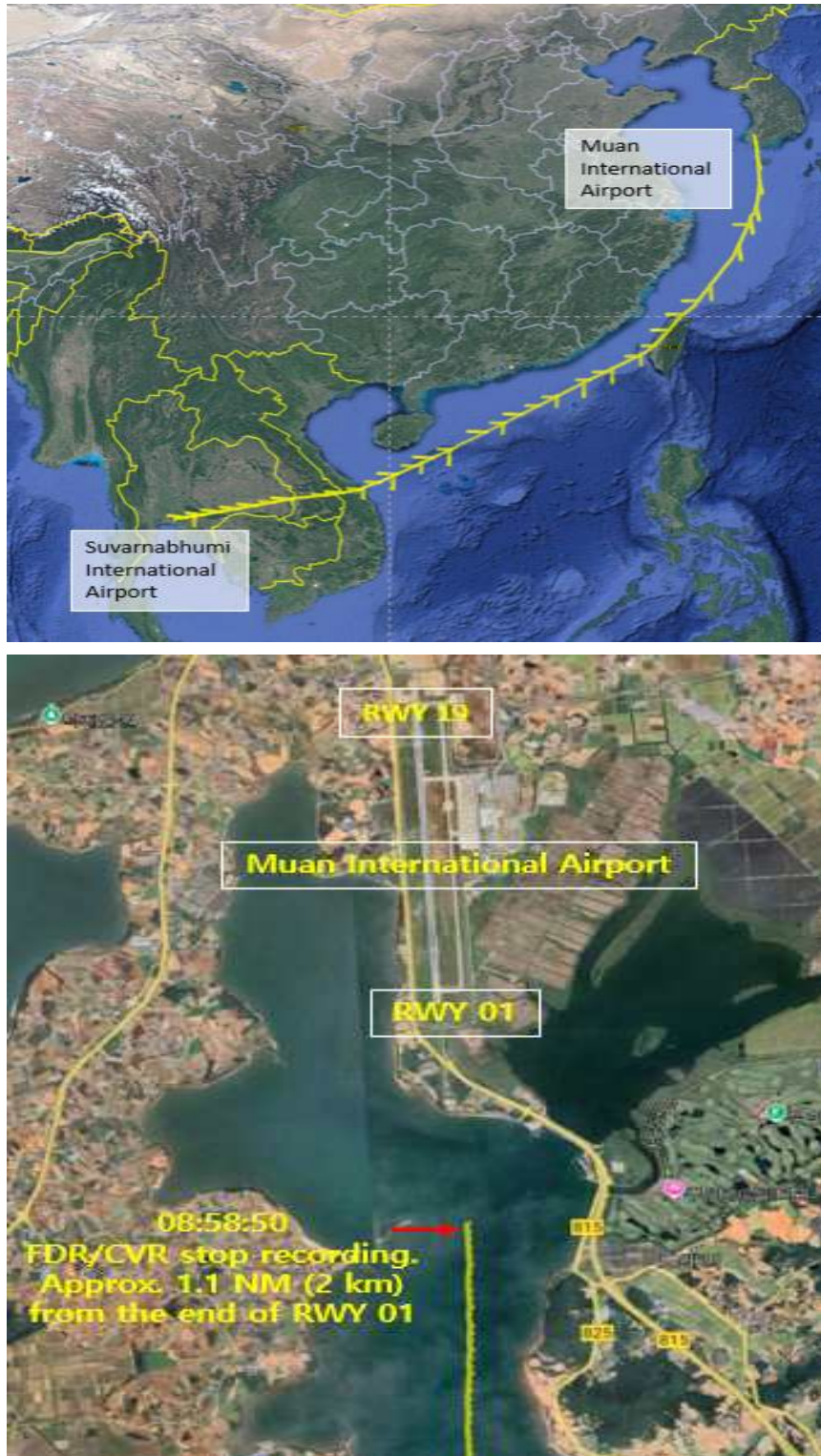
Figure 2. Flight path while the CVR/FDR are in operation

speed and pressure altitude when the recorders stopped were 161 kts and 498 ft, respectively. Figure 2 shows the flight path of HL8088 from its takeoff to where its flight recording stopped.